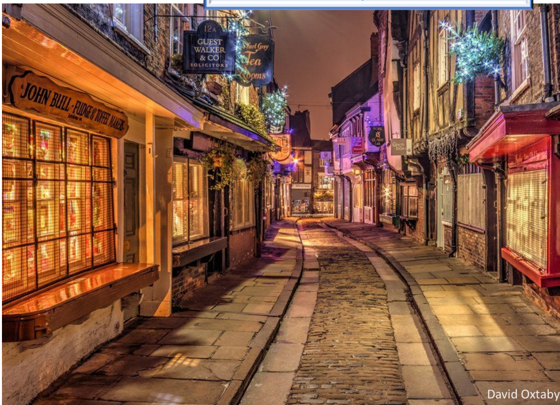
The Shambles, York.